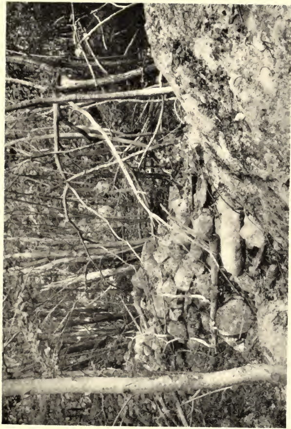
GLIMPSE OF THE OLD QUEEN'S FORT Near Wickford, Rhode Island. While the wall of the fort may be traced in its entirety, the dense growth of trees and brush, together with the innumerable boulders scattered over the surface of the ground, make a picture of more than a small portion impossible